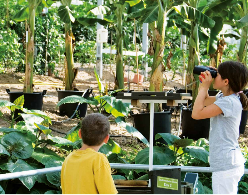
Wolhusen Tropical Centre