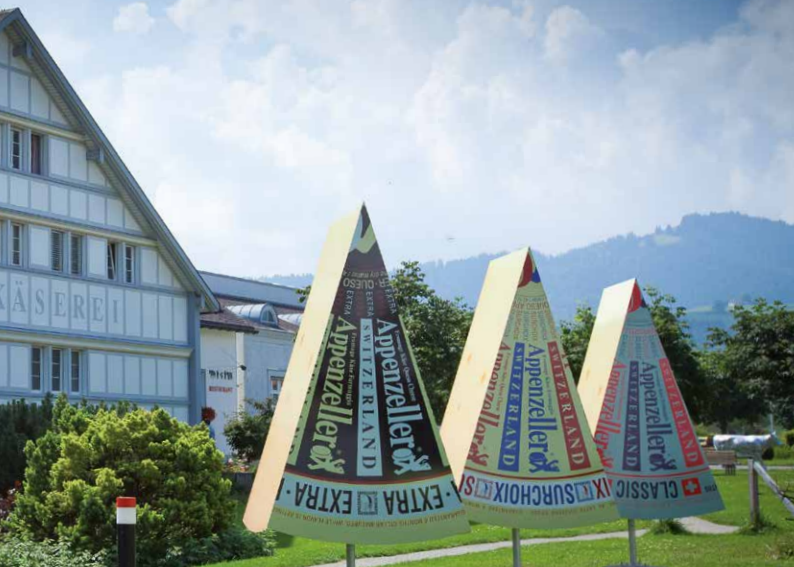
Show Dairy, Stein